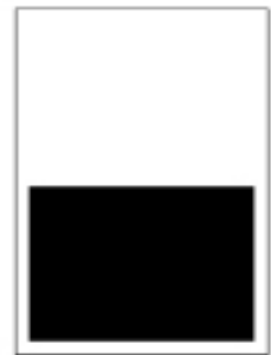
1/2 Page Horizontal