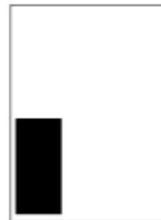
1/6 Page Vertical