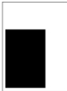
1/2 Page Vertical