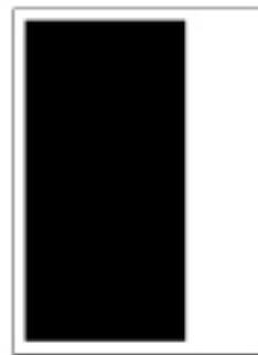
2/3 Page Vertical

Bleed Size: 17 x 11 1/4 Trim Size: 16 1/2 x 10 3/4 Live Area On Each Page: 7 3/4 x 10 1/4