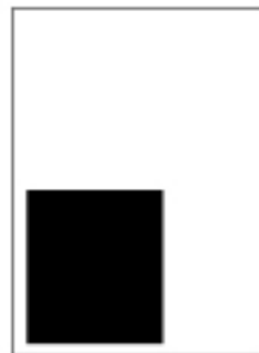
1/3 Page Horizontal