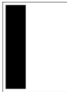
1/3 Page Vertical