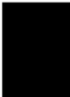
Full Page w/ Bleed

Bleed Size: 8 3/4 x 11 1/4 Trim Size: 8 1/4 x 10 3/4 Live Area: 7 3/4 x 10 1/4